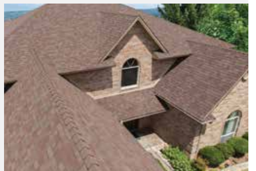
HEATHER: V, L