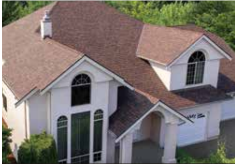
ANTIQUÉ BROWN: H, V, L

Matching colors available in high-profile EZ-Ridge™ XT as well as standard low-profile RidgeFlex™ hip and ridge shingles.