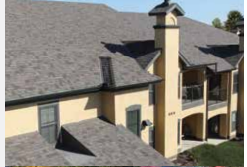
SHOWN IN: VISTA® AR NATURAL WOOD [ABOVE]; HIGHLANDER® NEX® AR SILVERWOOD [BELOW]