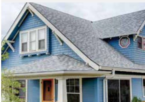
SILVERWOOD: H, V, L