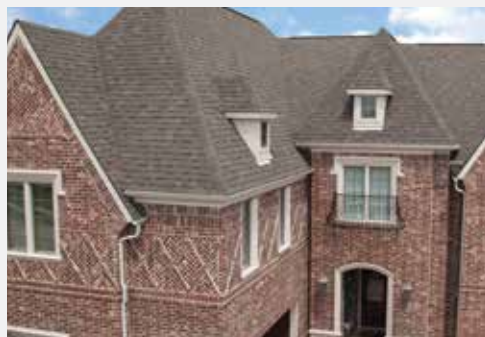
WEATHERED WOOD: H, V, L