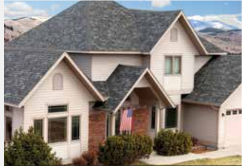
STORM GREY: H, V, L