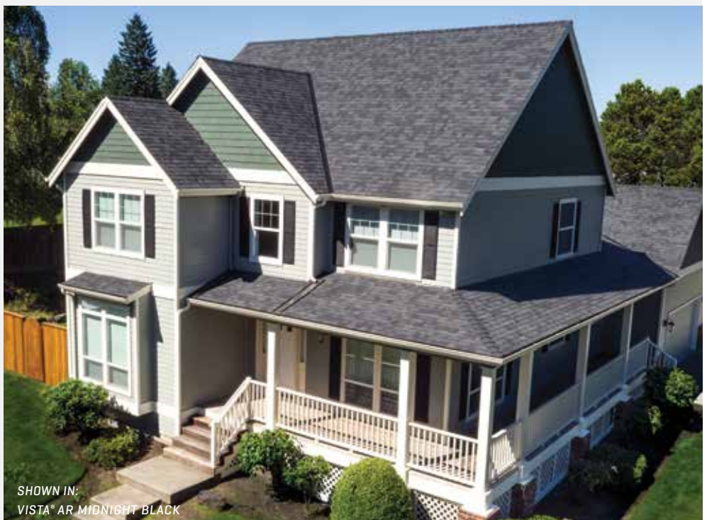
SHOWN IN: VISTA® AR MIDNIGHT BLACK