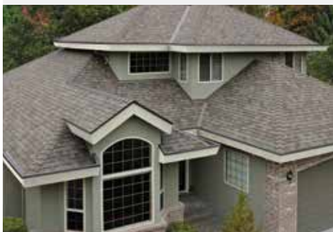
NATURAL WOOD: H, V, L