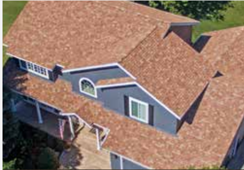
SIENNA BLEND: H, V, L