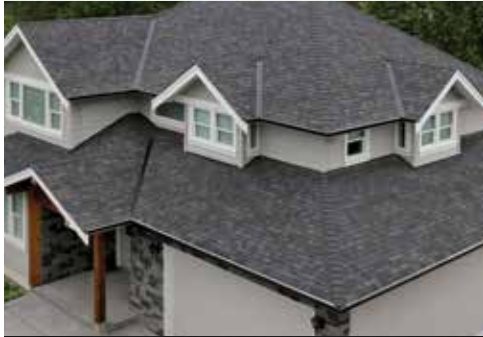
BLACK OAK: V, L

Distributed from Portland, OR: [H] Highlander® NEX® AR [V] Vista® AR Scotchgard™ Protector Lines include: [L] Legacy™ Scotchgard™ Protector