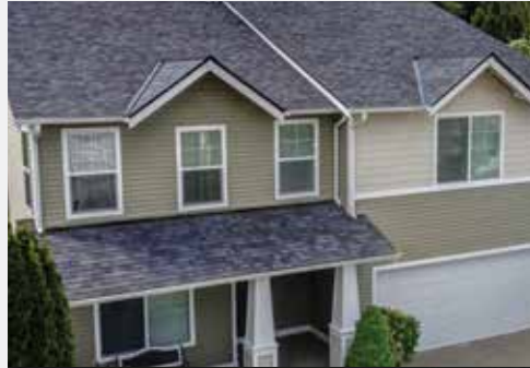
MIDNIGHT BLACK: H, V, L